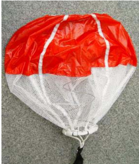
Pilot parachute PV – 038