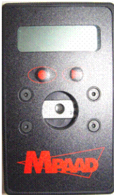
The size of the device is 100 x 62 x 20 mm.